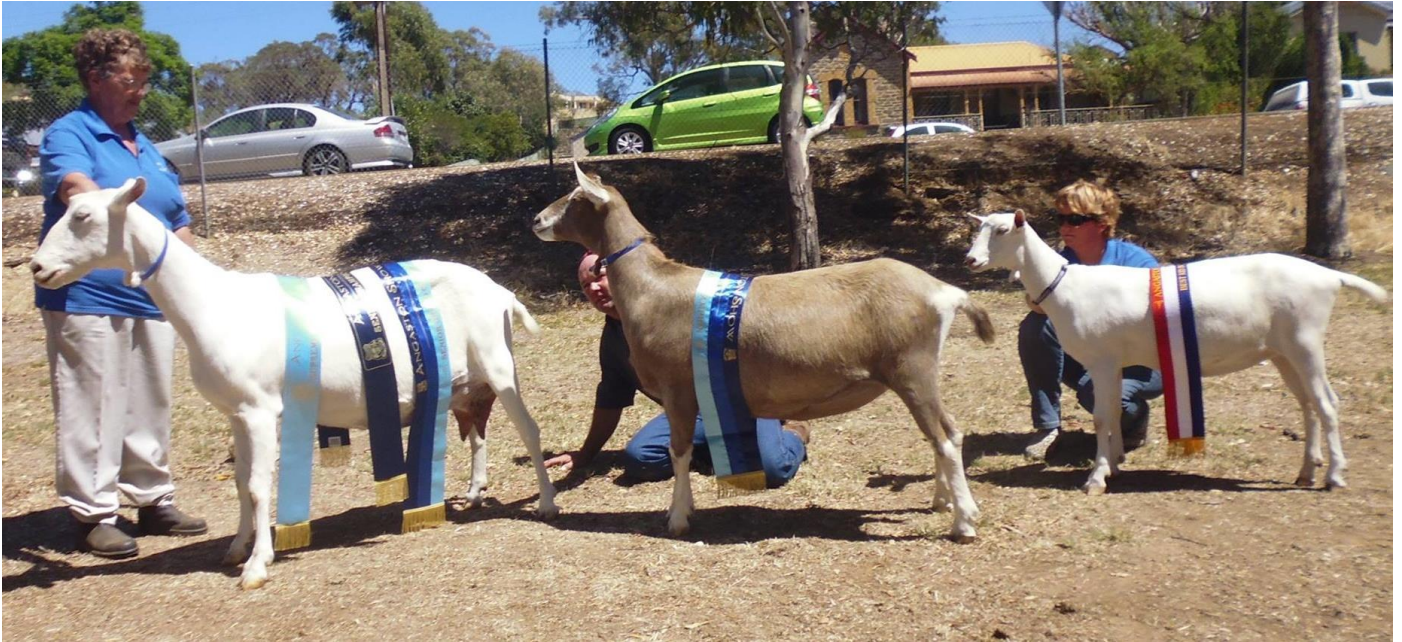
Senior Grand Best Best Saanen, Type and production 24 hour and best udder Glenforslan Skyelette, Junior Grand and best toggenburg Glenforslan Cinnamon Best Kid and junior champion Saanen Glenforslan Luna